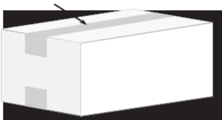
UPS Return Label